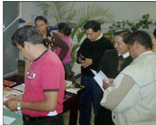
Participants in the conference enjoy some fellowship around the book table.